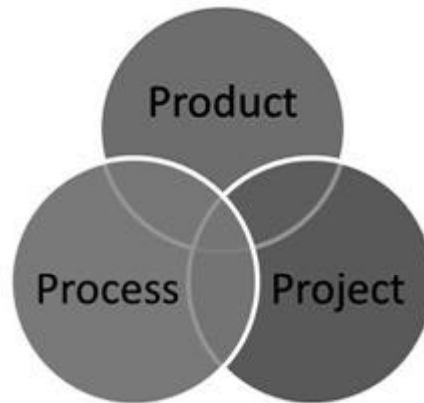
Fig. 1. Product, Process and Project points of view interacting from different but complementary quality parameters.

Even in this proposed scenario, where the customer experience is highly valued, it may happen that at first, a customer is attracted by the product quality features: the external view, the output of the organization's processes. After the initial contact, as the customer is part of a project, it may well happen that the customer is involved in the processes that lead to that product and therefore expects to receive a quality experience that surpass the software deliverable itself.